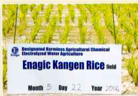
The “Enagic Kangen Rice Field” sign for the site of Paddy A created for regular observation. エナジック還元米の圃場と明記した定点観測用のA田

5月の連休中に作付けした、ほかの農家の農薬使用の水田(仮に「B田」)の稲穂も伸びていたが、特徴的なのは稲と稲の間隔だ。あきらかにA田の稲と稲の間隔はB田よりも空いていた。つまりB田のほうがA田より植えた稲の間隔が狭い(稲の本数が多い)ということになる。見た目にはまだわかりにくい、稲がもっと茂ってくるとその「フサフサ感」が違ってくるという。間隔のあいた(まばらな)A田の稲穂のほうが間隔の狭いB田で実る稲穂よりむしろ「豊か」になるという。あと2カ月もするとこれが証明されるはずである。