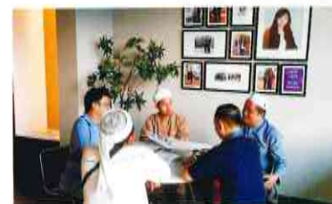
Busy showroom space いつも賑わうサロンスペース