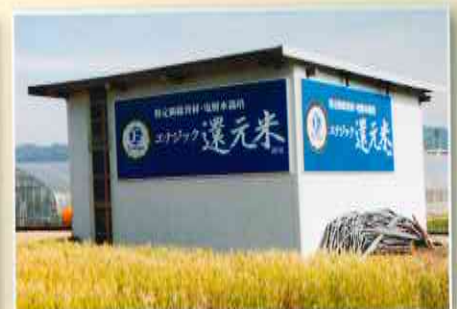
A large sign put up on the work shed to appeal to neighboring farmers. 作業小屋に取り付けた看板で近隣の農家にアピール