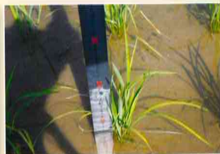
Rice plants growing steadily in Paddy A. 順調に成育するA田の稲穂