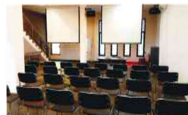
Seminar room equipped with a projector 映像機器も使えるセミナールーム