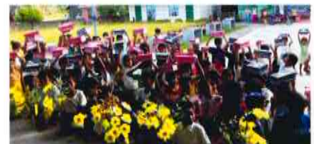
Happy children holding up their gifts