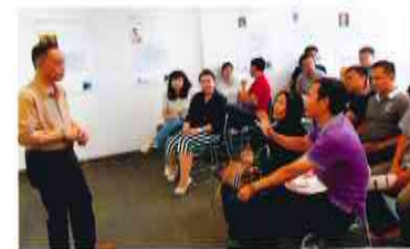
Seminars are held regularly セミナーも連日のように開催