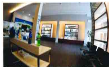
The 1st floor showcases the LevelLuk and related goods 1階にはレベラックや関連グッズが勢ぞろい