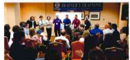
This is also a part of the training session.