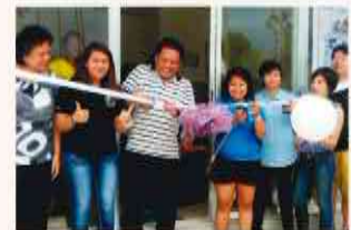
The opening ceremony for Kangen Oasis