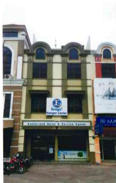
Office building bearing a massive Enagic logo 巨大なエナジックのロゴマークを掲げたオフィスビル