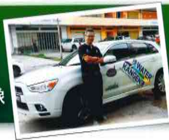
The team's Kangen Shop in Kota Kinabalu コタキナバルにあるチームの還元ショップ