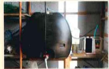
Super 501 installed in the workshop next to the water storage tank. 貯水タンクを付設した作業所内のスーパー501

Conducted by Ido Agriculture, transplantation of the “Electrolyzed Water Farming” in Kanagawa Prefecture was in full swing in the month of May. In rice farming, one of the most important processes is the rice seed disinfection. For the cleaning and disinfecting of the rice seeds, the Leveluk SD Super 501 was kicked into top gear as it generated acidic electrolyzed water, a “Designated Harmless Agricultural Chemical” approved by the Ministry of Agriculture, Forestry and Fisheries and Ministry of the Environment for its sterilizing power and its harmless effects on the human body and the environment.