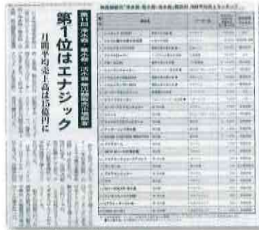
Enagic Branch News

The specialized journal of the distribution industry, Nihon Ryutsu Sangyo Shimbun, (combined issue of April 28 & May 4) has announced the average monthly sales figures of 2016 in the category of "generators of purified and electrolyzed water." Enagic's Leveluk SD501 came out on top with a monthly sales of ¥1.5 billion (including overseas sales), while the second highest was ¥916 million and the third came in at ¥630 million. Enagic's numbers were by far the best in this category, which is the direct result of all of your hard work. We are extremely grateful for your contributions.