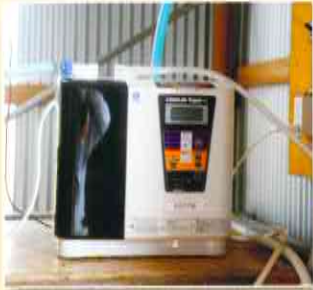
The Leveluk Super 501 unit that generates acidic electrolyzed water for disinfecting rice seeds 種籾の消毒用酸性電解水を生成するレベラックスーパー501

The Enagic Kangen Rice Project series, which started with the April issue, is now in its 4th chapter. Up until now, we have been reporting on the progress of the "Electrolyzed Water Rice Farming" made by Ido Agriculture in Kagawa Prefecture, and in this month's issue we report on the condition of the rice paddies in early June.