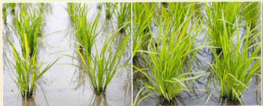
Paddy A (left) is sparsely planted compared to Paddy B, in which agrochemicals are used(both transplanted in May). A田(左)のほうが農薬使用の一般水田(B田)より稲種の密度は低い(いずれも5月の連休中に植えた稲)