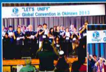
2013 in Okinawa