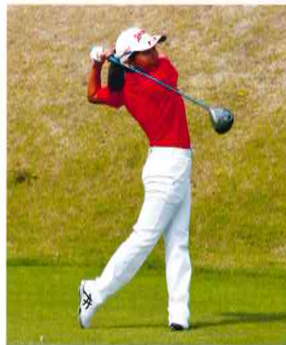
Sadoyama, drawing attention all over Japan.

Although not coming out on top this time, just the experience of competing in these 2 major championships is surely valuable to their future as golfers.