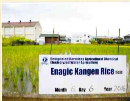
Rice transplanted in April has grown nearly 50 cm tall. 4月に作付けた稲の穂は50cm近くまで成育

農薬を使わずレベラックが生成する酸性電解水だけで種籾から田植え用の苗を消毒するという手順で、第1回の4月10日以来、作付けが繰り返されてきた。その1回目の稲は長いものではや50cmほどに成育していた。また、いずれも5月の連休に田植えされた電解水稲作の田(A田)と農薬使用の一般の田(B田)をくらべてみると、1カ月後の段階でA田のほうがB田より明らかに密度が低い(まばら)。それでもこれから育つ過程でA田の稲は十分に密生していくのだという。これが電解水稲作の大きな長長といえるのだろう。