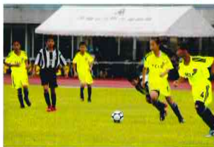
Players racing about in the field (picture from last year's event)