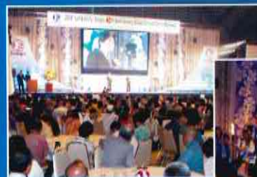
2014 in Okinawa