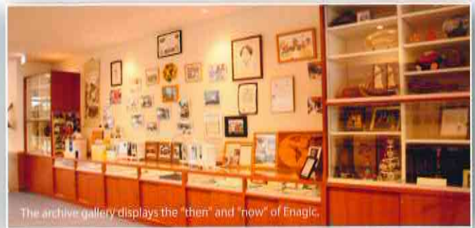
The archive gallery displays the "then" and "now" of Enagic.