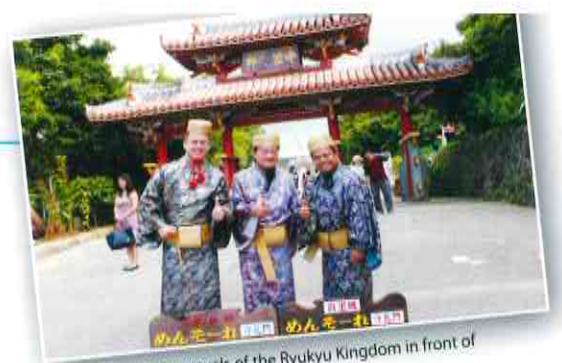
Transforming into royals of the Ryukyu Kingdom in front of Shurei gate.