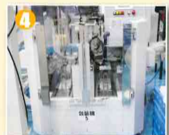
A test result of “undetected” fills up the report made by the Environmental Research Center. 「環境研究センター」の検査結果には農薬を「検出せず」だけが並ぶ

いよいよ最後の刈り入れの時節だ。そこで刈り入れ直前の一般の田んぼと井戸農産の電解水稲作の田んぼ（還元田）を比較してみた。上記の写真では①が還元田、②が一般田である。一目瞭然、①では②には見られない「雑草」（背の高い植物は粟）が盛大に茂っているのではないか。一般田では農薬・化学肥料を大量に使用するから自ずと雑草の類は生育しない。還元田はその逆。雑草が茂る還元田の電解水稲作こそ、いかに安心安全な米づくりをしているかを証明している。