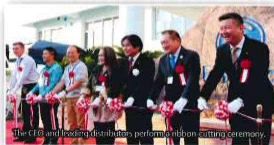
The CEO and leading distributors perform a ribbon-cutting ceremony.