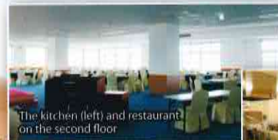
The kitchen (left) and restaurant on the second floor