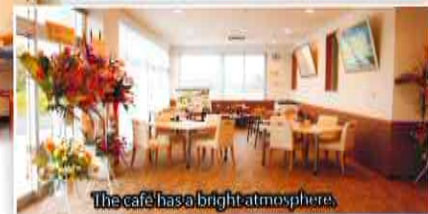
The café has a bright atmosphere.