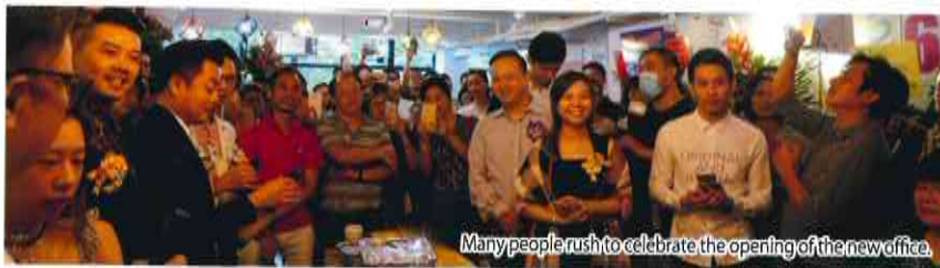
Many people rush to celebrate the opening of the new office.