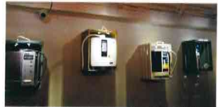
The Leveluk series are displayed on the wall inside the office.