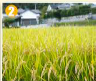
No weeds can be found in the normal paddy using agrochemicals. 農薬使用で全く雑草が見られない「一般田」