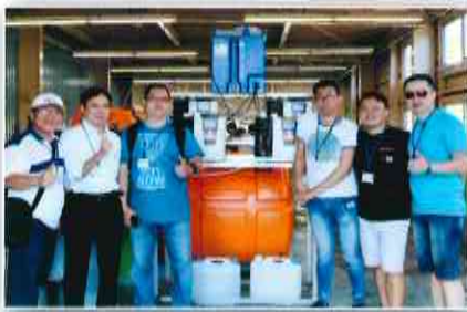
Visitors observe the production of Kangen Ukon \Sigma at the Ukon Factory.