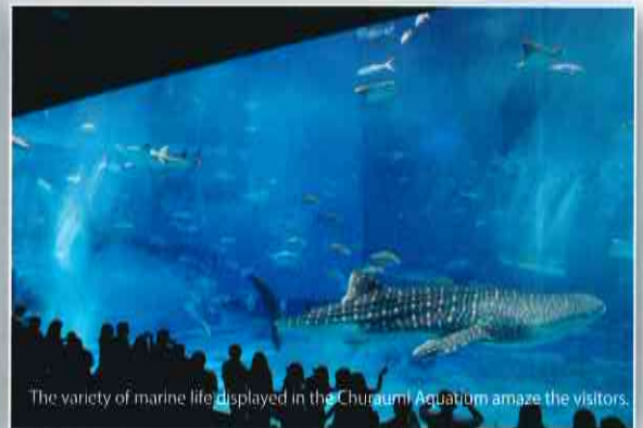
The variety of marine life displayed in the Churaumi Aquarium amaze the visitors.