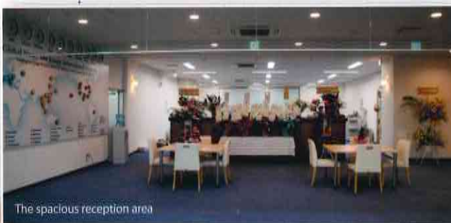
The spacious reception area

This all-inclusive facility of Enagic Resort in Sedake, Nago, patiently awaits your arrival.