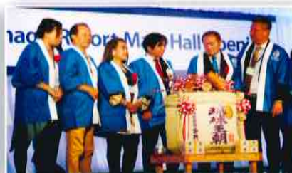
Okinawan sake or, awamori, of the Ryukyu Ohcho brand, is used for the Kagami-wari ritual.