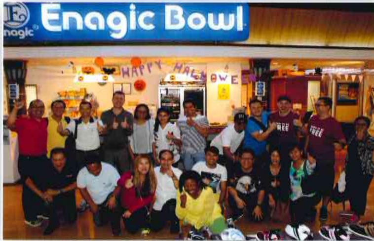
The visitors enjoy bowling at Enagic Bowl Mihama.