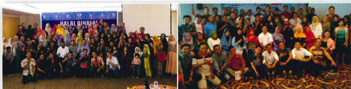
A large number of women could be seen participating at each venue. (Left) Makassar venue and Jambi venue.