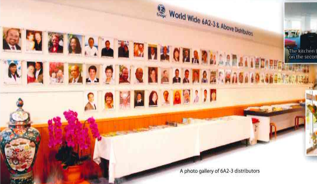
A photo gallery of 6A2-3 distributors