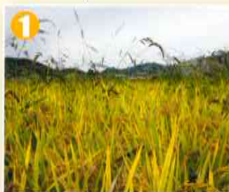
Most of the weeds found in the Kangen paddy are millets. 「還元田」に茂る雑草の多くが背の高い粟

The milling and packaging company, Kuriya (Kagawa Prefecture), is a long-established company that has been in business for 134 years. The Kangen Rice is milled, screened, weighed, packaged and vacuum-sealed there before reaching the consumers. In fact, Kuriya is so thorough in their sanitation management that they also use electrolyzed water in the process of sanitizing and disinfecting the facility (photo ④). The Kangen Rice created by the “electrolyzed water trio” of Ido Agriculture (production), Kuriya (milling and packaging) and the maker of electrolyzed water generators, Enagic (sales), will be available for sale around the world starting this year.