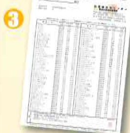
Kuriya's packaging machine is disinfected with electrolyzed water. 電解水で消毒する「くりや」の包装機械