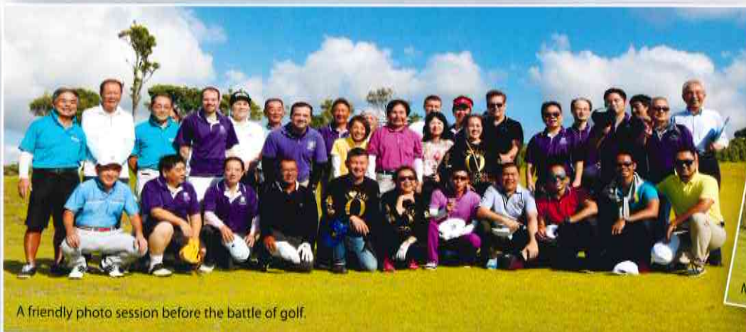
A friendly photo session before the battle of golf.