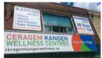
Toronto (downtown) center

Address: 1367 Upper James St. Hamilton Phone: (905)296-0433