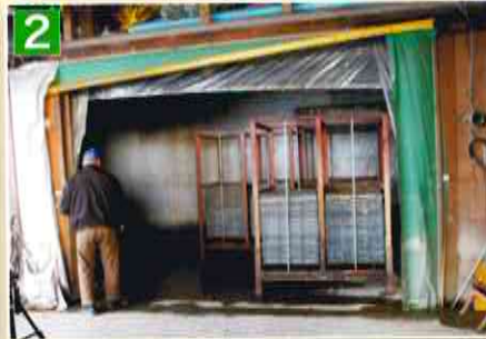
2 To speed up the germination process, rice seeds are kept in a heated room called muro. ムロと呼ばれる暖房のきいた部屋で種籾の発芽を促す