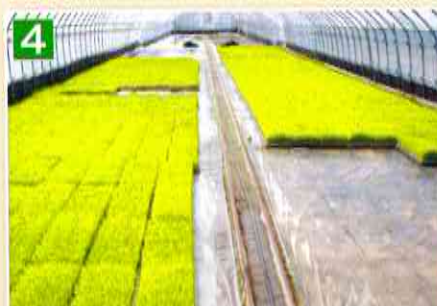
4 Rice seedlings are nurtured after being moved from a muro to a greenhouse. ムロからビニールハウス(温室)に移し生育させた苗