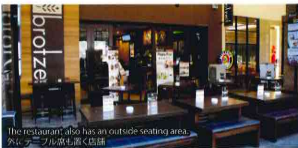
The restaurant also has an outside seating area. 外にテーブル席も置く店舗

Kangen Water is not only used in all of the cooking at Brotzeit, but is also used when diluting alcohol and for chasers. As Rogelio happily explains, "cleaning products are not needed anymore," strong electrolyzed water is used when cleaning the premises and cookware. Now, Brotzeit has successfully opened 7 branches, expanding throughout Asia, including 3 in Malaysia. The very first Leveluk, though, was installed in Mid Valley, the forerunner of all the branches. "I hope to eventually install Leveluk in other branches," Rogelio expresses his vision for the future.