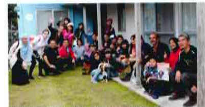
Visiting the house the CEO was born in 大城会長の生家を訪問