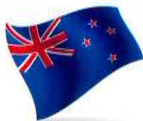
New Zealand ニュージーランド