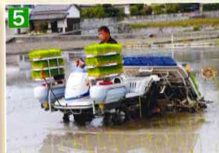
5 Transplanting of the seedlings grown in the greenhouse (first planting on April 10). ビニールハウスから搬出した苗を作付けする(4月10日の第一回の田植え作業)