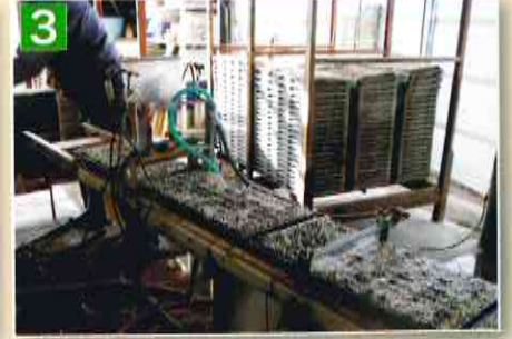
3 Seedlings are again treated with acidic electrolyzed water after a couple centimeters of growth. 数センチに伸びた段階で再び酸性電解水で消毒を実施