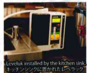
Leveluk installed by the kitchen sink. キッチンシンクに置かれたレベラック