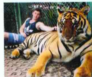
Boldly posing with a tiger during his trip to Thailand 度胸は人一倍? タイ旅行中に虎とたわむれる