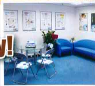
The Kangen Office of the Platinum Water Club. チーム「プラチナム・ウォータークラブ」のオフィス