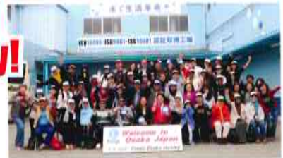
Malaysia team visiting the Osaka Factory. 大阪工場を見学したマレーシアチーム

まれ故郷である名護市で、エナジック瀬嵩カントリークラブとウコン工場、さらに会長の生家を訪問し、会長夫妻との懇親会もおこなわれ、参加者はエナジックの原点を体感しました。さらにエナジック美浜ポウリング場や天然温泉アロマなども訪れ12日に帰国の途につきました。