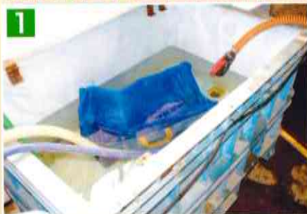
1 Rice seeds are disinfected in a tank filled with acidic electrolyzed water. 水槽に貯めた酸性電解水で種籾を消毒